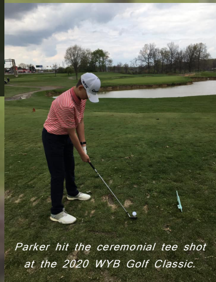
Parker hit the ceremonial tee shot at the 2020 WYB Golf Classic.